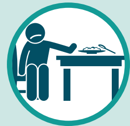
New loss of sense of taste or smell